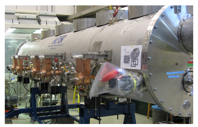
Figure 3: The ICM after final assembly.

kW average power, more than the 50 kW needed for 100 mA operation. A complete description of the cryomodule construction and testing can be found in references [15,16] (see Fig. 3).